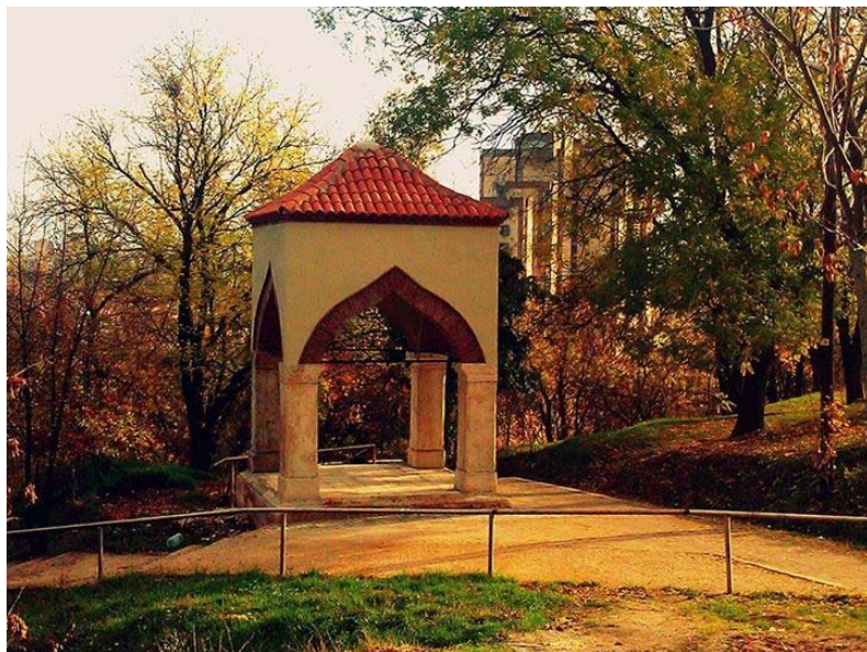
Monument for the Bosnian Princess Katarina in Skopje, 2014

Why all this? Negligible amount that could have been able to extract from their monthly salary and the rest of the apanage that has any entity and /or state representative/politician, so far could not be targeted because of the culture of remembrance that the girl, the daughter of Queen Catherine, whose bones are still in Rome, although they say that for years are trying to transfer them in BiH. However, consensus about that has to be accomplished. Within the culture of remembrance: Whose was Queen Catherine? Of Bosnia and Herzegovina? Yes. It's exactly what is this problem about. Here the word "Bosnia and Herzegovina" is understood with the one of them as Unitarianism, in other ones as example of identification and among the third as example of tolerance. But, not at anyone still, in the culture of remembrance, there is no such example of universality in the fact that on these areas walked others prior to us and whose being of multi-identity we make today. And in a culture of remembrance.