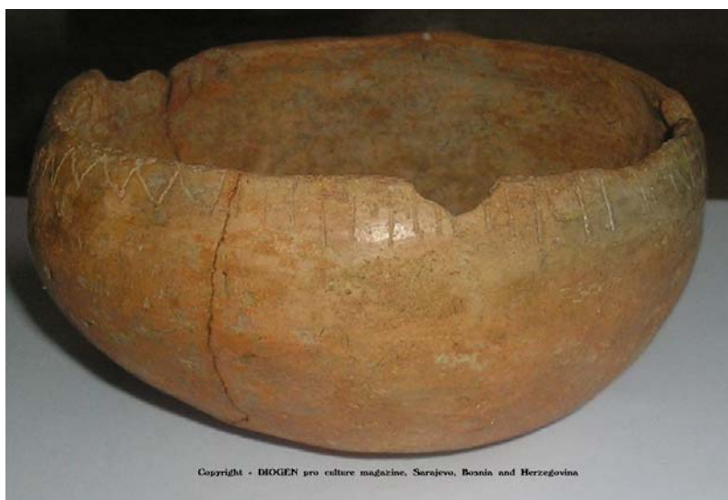
The oldest written monument in Bosnia and Herzegovina – The book „Written word in Bosnia and Herzegovina“ – part written by Đuro Basler and entitled: Greek_Latin literacy“ http://www.diogenpro.com/sumrak-bosanskohercegovackog-sjecanja.html

The answer is simple. No authority in these areas, since the old Yugoslavia and up to these days has not paid attention to the oldest written monument in Bosnia and Herzegovina. Nine years ago, in 2005 the space where it has been found was labeled and marked as a national monument by the Commission to Preserve National Monuments ... quote ... The archaeological site - Pod, a prehistoric hill fort settlement in Bugojno, is declared as a National Monument of Bosnia and Herzegovina ... end of quote. Form satisfied until essentially nothing was done to make this place a pilgrimage of culture of remembrance.