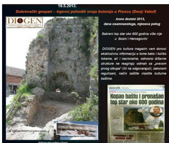
DIOGEN pro kultura magazine, May 2013: http://www.diogenpro.com/rasprodaja-bh-kulturne-bastine.html

Anno Domini 2013 DIOGEN pro culture magazine wrote about "the Dubrovnik gentlemen who came to check out their colony in Prusac" on September 2013 and how and how much local as well as national or state structures do not respond immediately with the "right of first purchase" and/or an appropriate, legally regulated, way protected own cultural heritage.