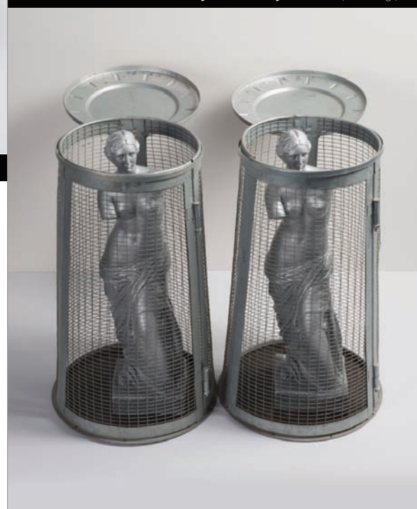
Twenty-first Century Hellenism , assemblage, 2005