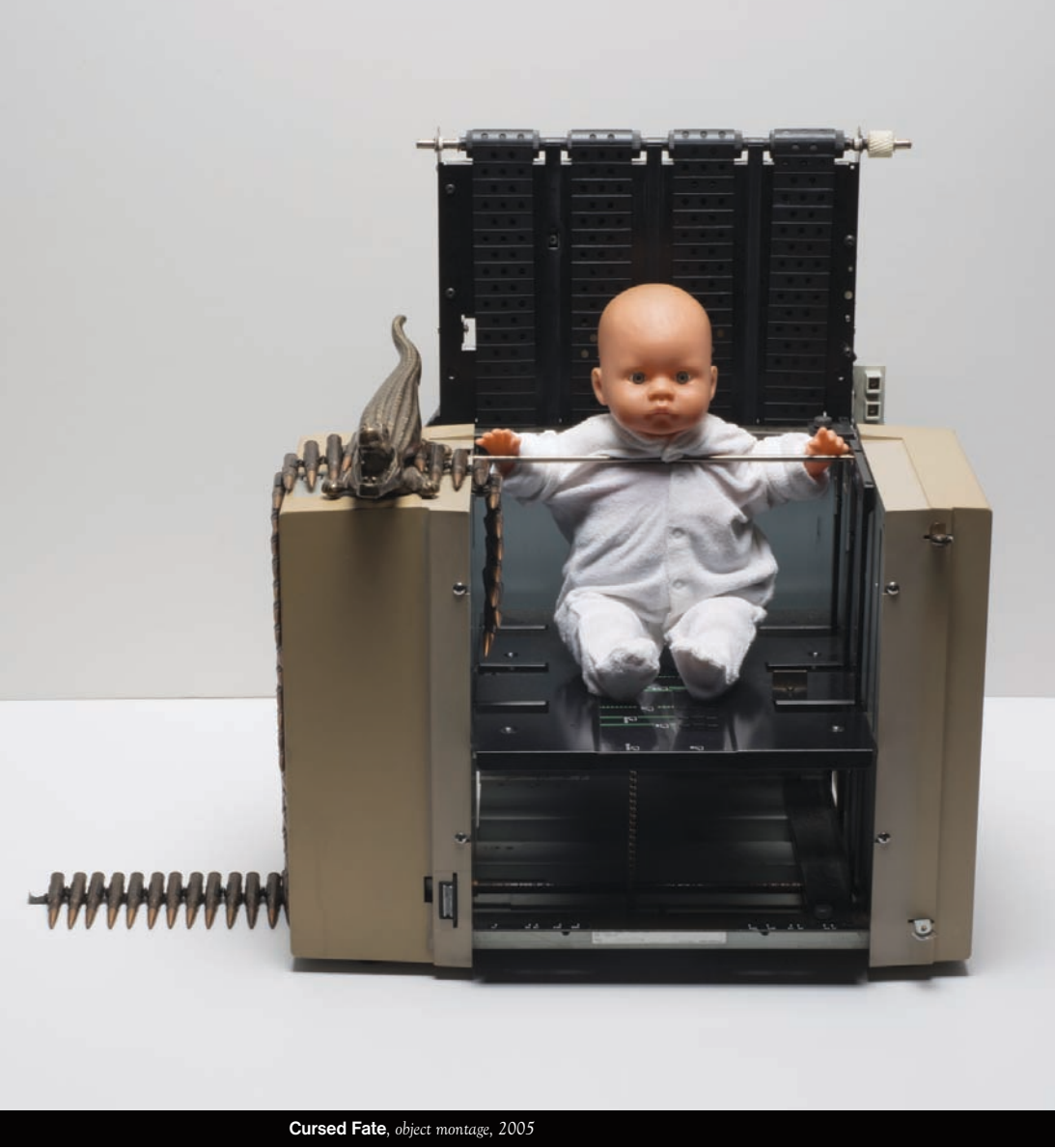
Cursed Fate, object montage, 2005