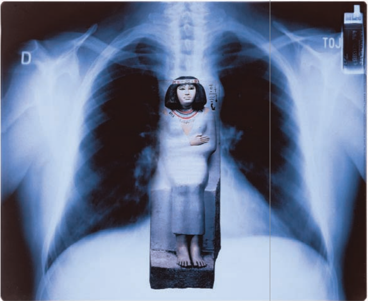
Nofret, x-ray art, asemblage, 1996

FOR DIFFERENT GENRES AND TECHNIQUES IN HIS CREATIVE WORK HE HAS RECEIVED 45 AWARDS. HE ALSO GOT 9 AWARDS FOR HIS SUCCESSFUL COOPERATION IN DIFFERENT CULTURAL PROJECTS.