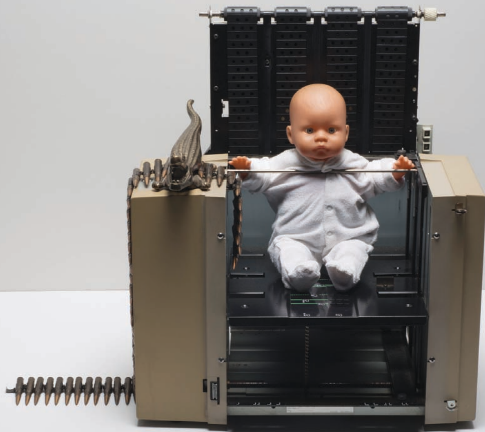
Cursed Fate , object montage, 2005